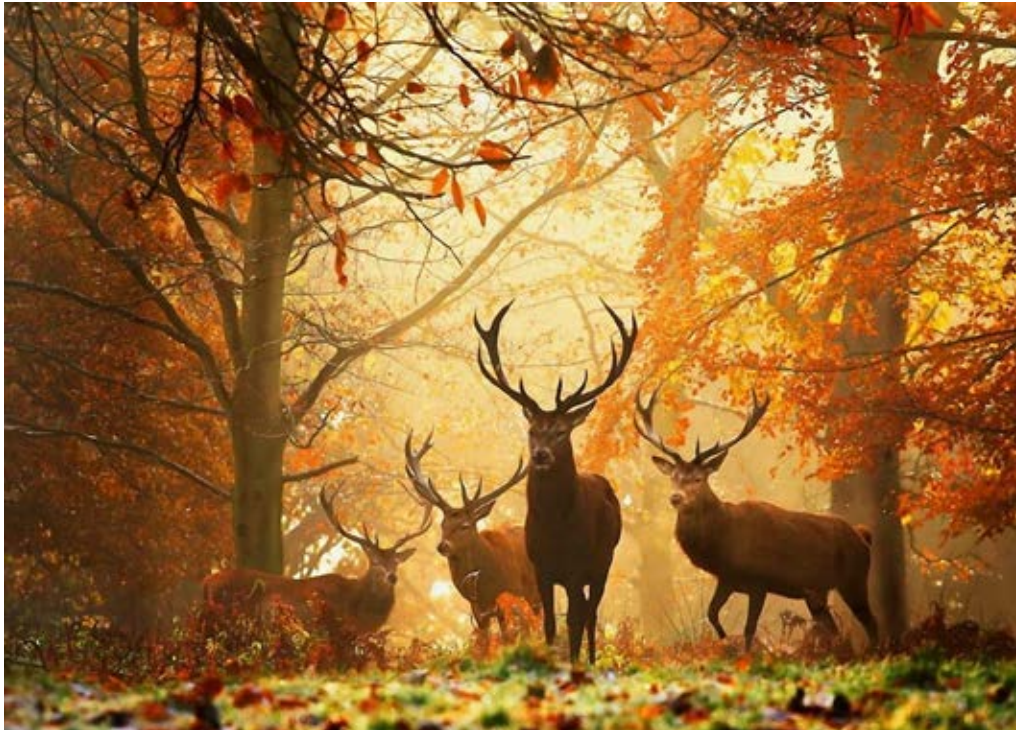
DEER WITH MATURE ANTLERS IN AN AUTUMNAL WOODLAND SUNRISE